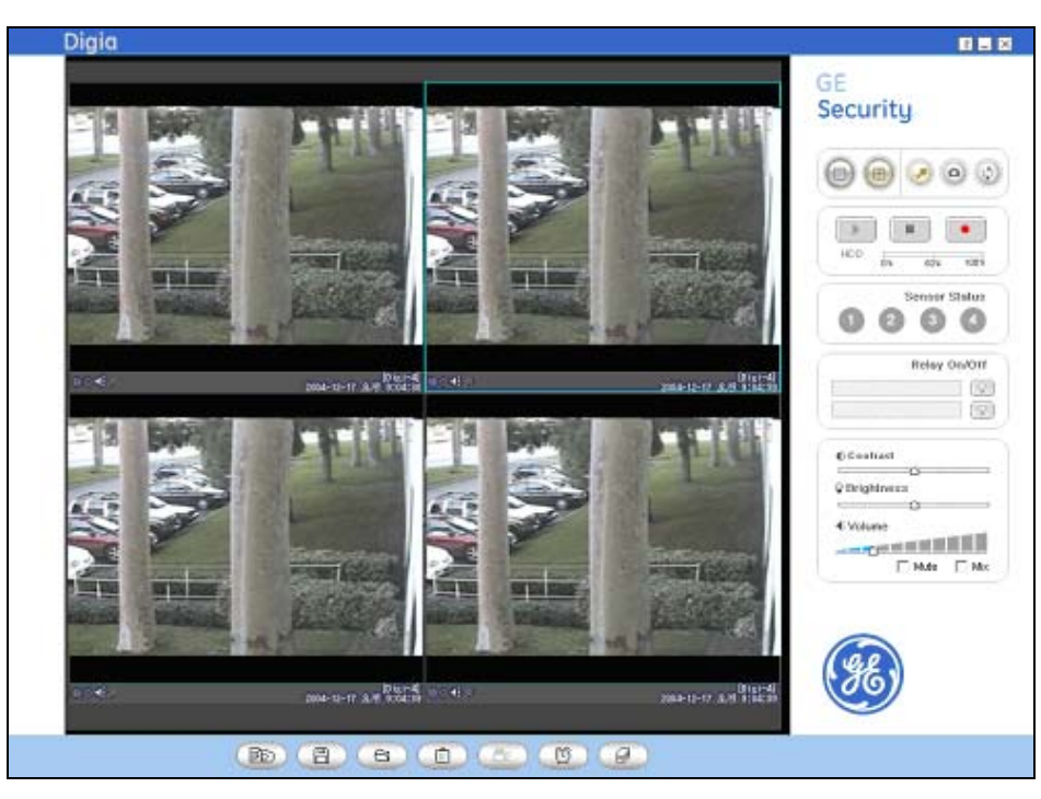
Figure 1. Main user interface

The video display window is located on the left of the screen, while control panels are located on the right and the bottom of the screen. Frequently used control buttons are located on the right of the screen, and buttons which are used less frequently are located on the bottom.