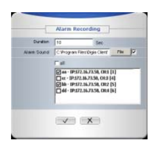
Figure 11. Alarm recording

You can set up the Digia client to record for a specific amount of time when an alarm is triggered. To set up an alarm recording ( Figure 11 ), do the following: